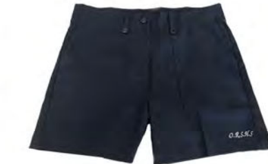
Waist Fit Shorts