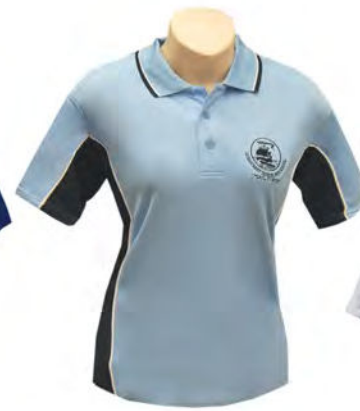
Middle Secondary Year 8-9