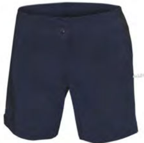
Cuff Shorts Clearance $5