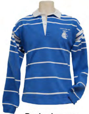
Rugby Jumper Year 11-12