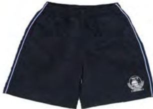
PE Shorts - Hipster Fit