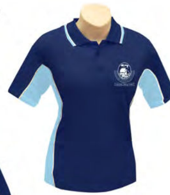
Junior Secondary Year 7