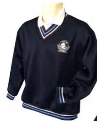
V-Neck Jumper Clearance $5