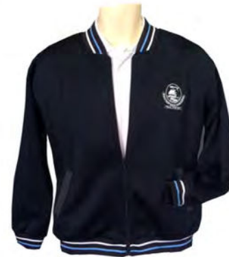
Bomber Jacket Clearance $5