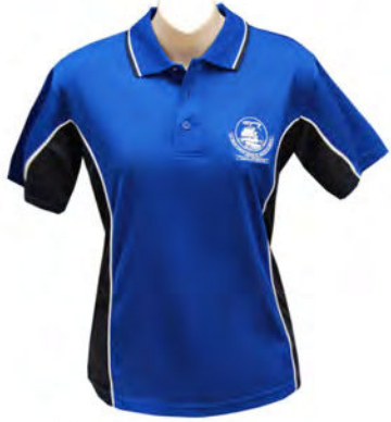
Specialist Program Polo