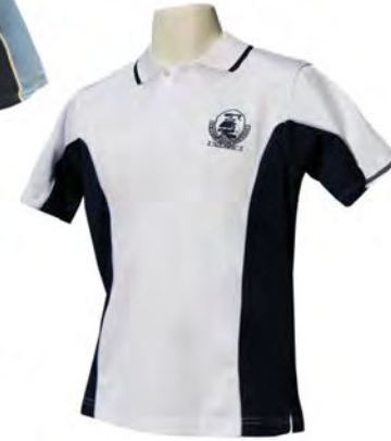
Senior Secondary Year 10,11,12