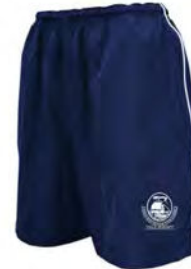
PE Shorts - Standard Fit