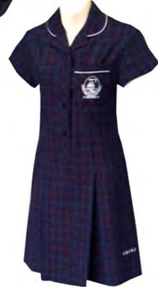
Dress Clearance $15